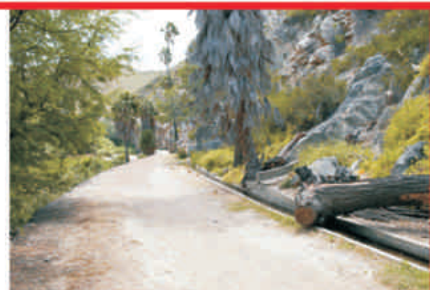
ABOVE: Lovers Walk received a facelift as part of the Montagu Mountain Reserve upgrade.

The designing of signs for the Dassieshoek Mountain Reserve (Arangies Kop Hiking Trail) is currently underway and these signs will also be upgraded soon.