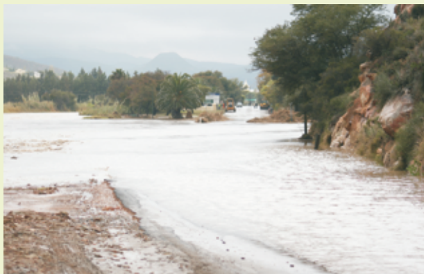
Plans are made to prevent another flooding incident in Montagu.