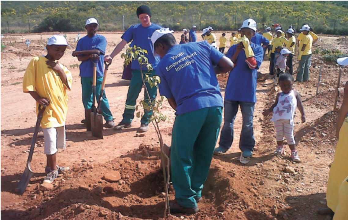
A community coming together to celebrate life through planting trees.

We trust that events like this one will raise environmental awareness amongst our community and promote the cleaning and greening of the environment.