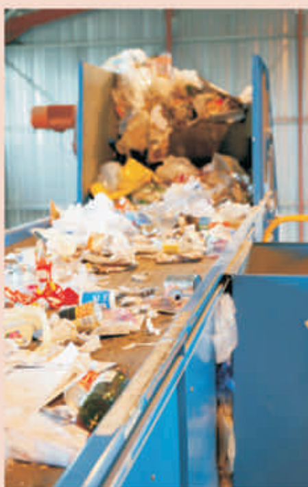
The sorting line where the recyclables are picked out and grouped together.