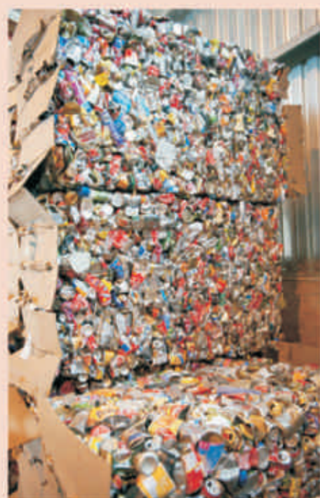
An impressive sight, a massive number of cans are sorted and ready for recycling.