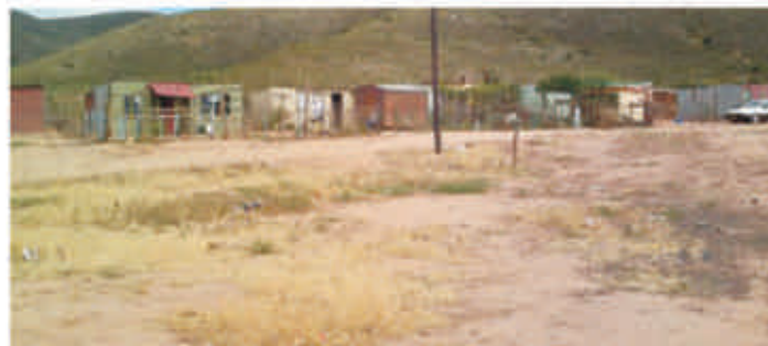
'n Speelpark is opgerig by dié informele nedersetting. Links is hoe dit voor die tyd gelyk het en regs is werkers besig met die belangrike opknappingswerk.