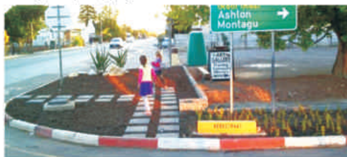
Links bo: Die hoek van Kerk- en Voortrekkerstraat lyk soos 'n nuwe sikspens. Regs bo: Selfs Bonnievale se jongklomp het ingespring om te help skoonmaak.