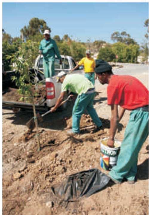
Duisende bome is geplant as deel van die Bonnievale Droom-projek.

* Vir meer inligting, bel Theuns Coetsee by 082 417 8597 of stuur e-pos na theunscotsee@gmail.com .