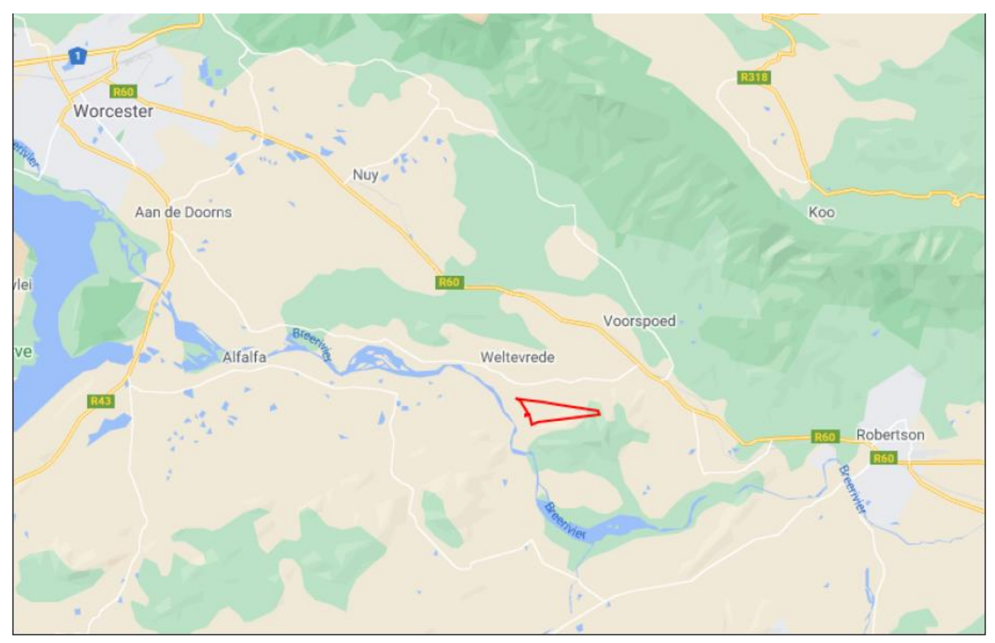
Figure 1: Location of Farm Vergelegen (RE/767), Eilandia, Robertson (red polygon).