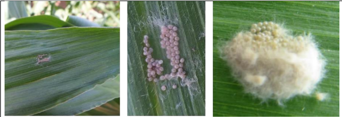
Eggs on maize leaves

For more information about the life cycle and identification of FAW, click here ►