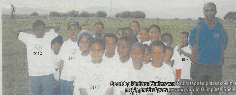
Sportdag kinders: Kinders van Robertsonse plaasskole het met 'n pretdrafgees gevang vir die Olimpiese Spele.

Die fantastiese gees wat geheers het, het bygedra tot die sukses van die dag en die raadslede en amptenare wat die verrigtinge bygewoon het, word bedank vir hul belangstelling en ondersteuning.