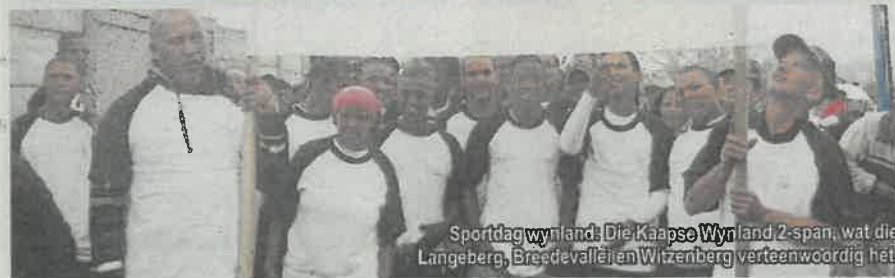
Sportdag wynland: Die Kaapse Wynland 2-span, wat die Langeberg, Breedevallei en Witzenberg verteenwoordig het.