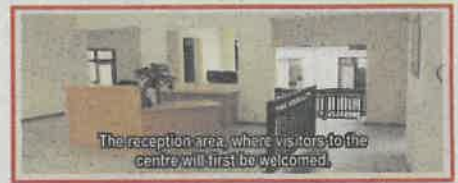
The reception area where visitors to the centre will first be welcomed.

be moving into the Thusong Centre during the month of July, are the Department of Social Development, the Western Cape Education Department, the Department of Agriculture and