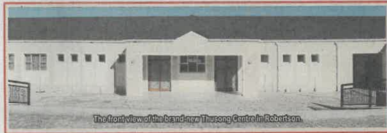
The front view of the brand-new Thusong Centre in Robertson.

Municipality that hasn't been available previously. This will mean that residents will not have to travel to Worcester to apply for IDs, passports, death and birth certificates or marriage certificates and other services. Services that have signed lease agreements with the Municipality and that will