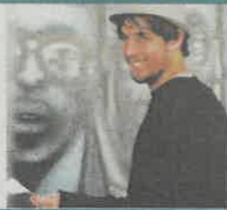
Straatkuns sal dorp opvrolik bl. 3