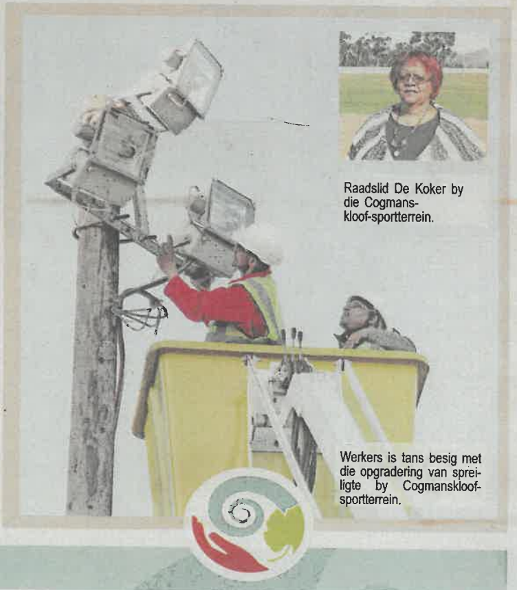
Werkers is tans besig met die opgradering van spreiligte by Cogmanskloof-sportterrein.