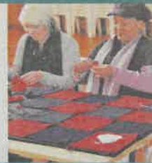
Knit-a-thon for warmer winter p 4