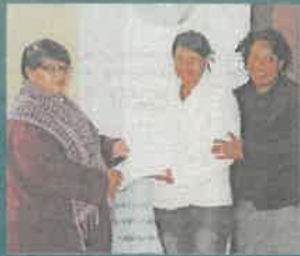
Langeberg gets business boost p 2

MORE THAN JUST NEWS AND VIEWS * MEER AS NET INSIGTE EN BERIGTE