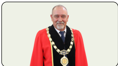
EXECUTIVE MAYOR ALD. SW VAN EEDEN

Following the local government elections that took place on the 1 November 2021, the Langeberg Municipality has been structured with the embodiment of a Council as follows: There are a total of 23 councillors with 12 being ward councillors and 11 being proportional representation councillors.