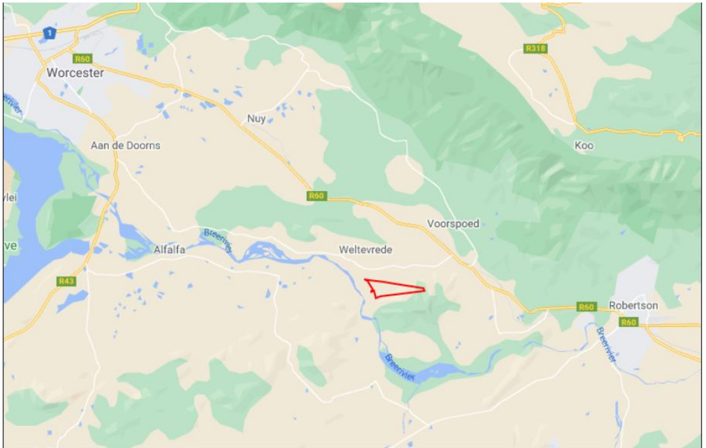
Figure 1: Location of Farm Vergelegen (RE/767), Eilandia, Robertson (red polygon).