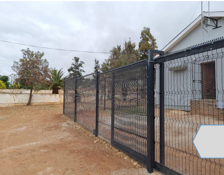
Call Centre (Ashton) Fencing