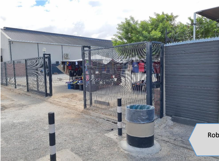
Robertson Informal Trading Fencing