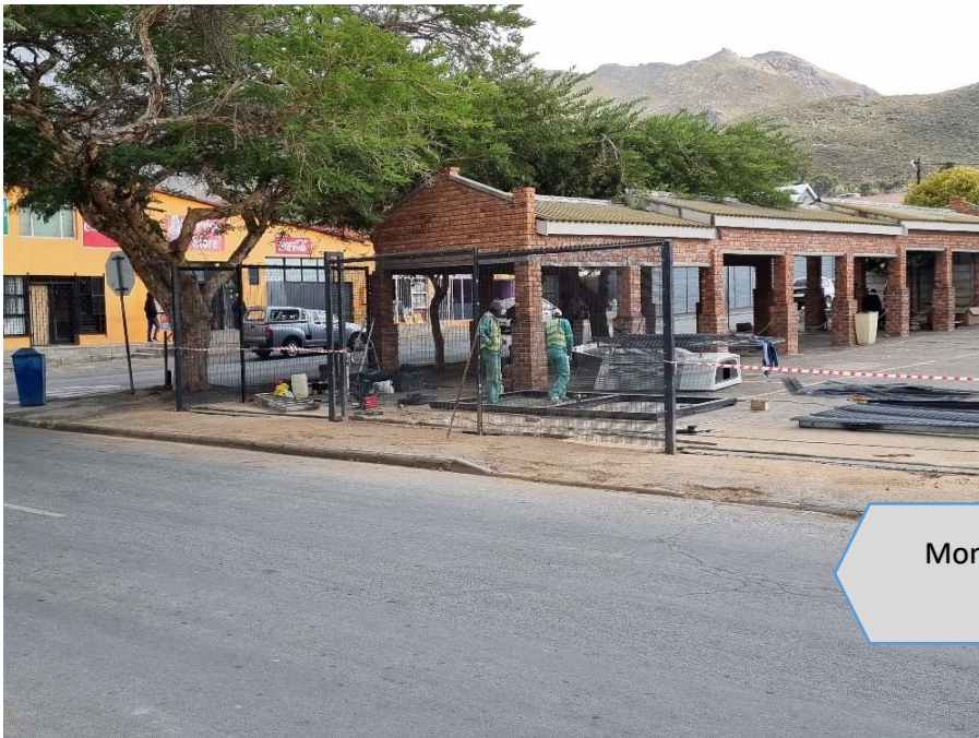
Montagu Informal Trading (Fencing)