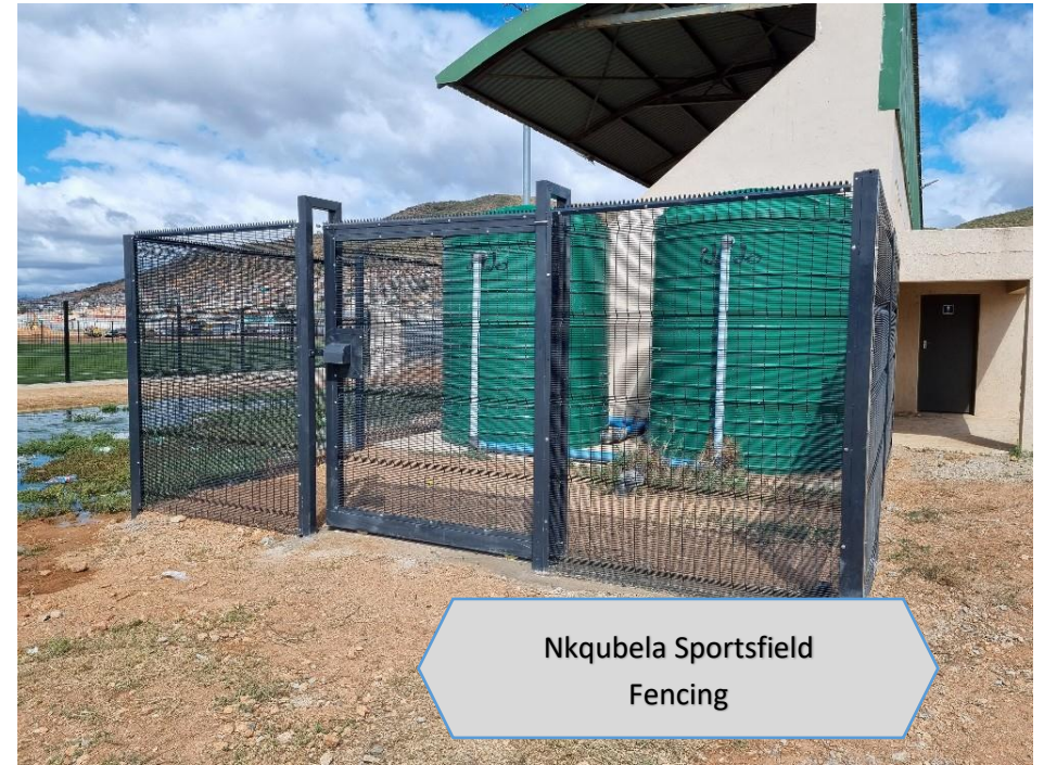
Nkqubela Sportsfield Fencing