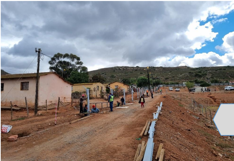
Happy Valley (Bonnievale) Sportsfield (Fencing)