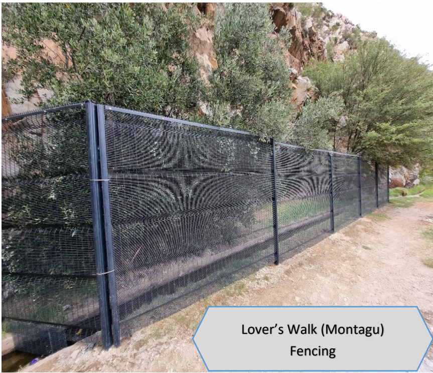
Lover's Walk (Montagu) Fencing