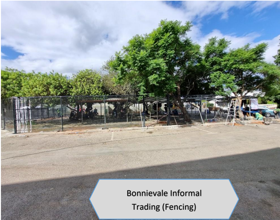
Bonnievale Informal Trading (Fencing)